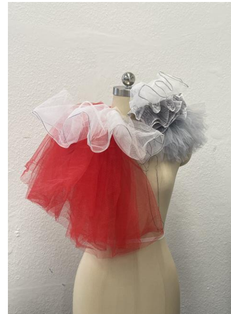
Above left: flower drawing by Matilda